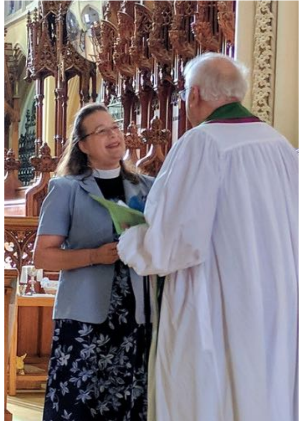
At Niagara Cathedral