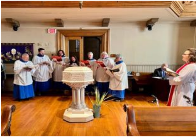
Palm Sunday~ March 24 th , 2024