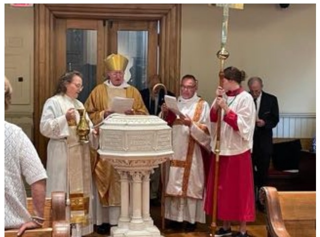
Renewal of Baptism Vows