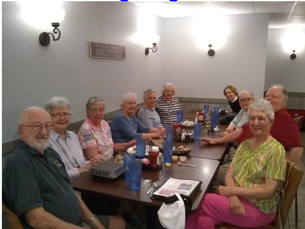
The "Lunch Bunch" crew gathered at the Farmer's Daughter restaurant in Urbana for food and fellowship on July 10th.