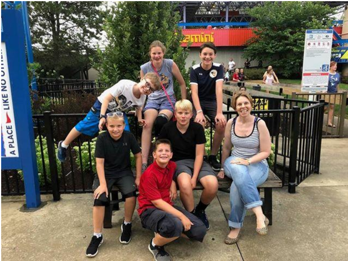
Some happy youth (and honorary youth) paused for a photo during their Cedar Point day on August 7th.