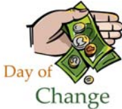
Day of Change