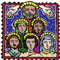
ALL SAINTS' DAY