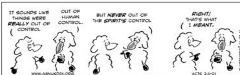
"Agnus Day" cartoon appears with the permission of www.agnusday.org