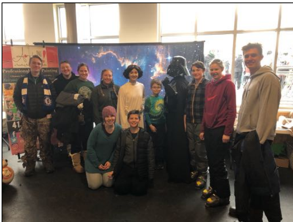
Youth Group members took time out of their ski day at Mad River Mountain last month to pose for a photo with Darth Vader and Princess Leia in the lodge! (2/19/2019)