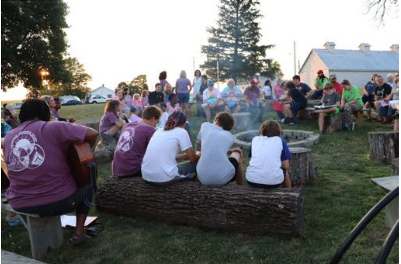
Christ Church families and friends had a fantastic time praying and playing together at the last Procter Family Camp of the summer in early August.