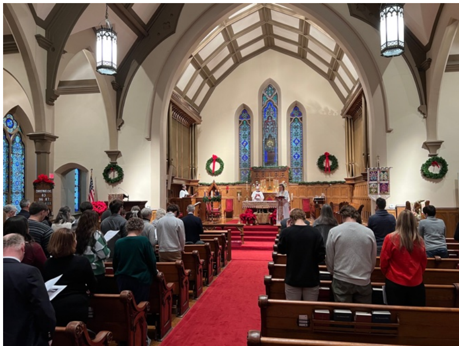
Christmas Eve, 6:45 PM Service, 12/23/24